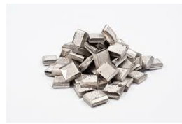
Fig. 2 Electrolytic Ni Squares

Electrolytic nickel anode is produced by electrodepositing metal from solution onto substrate media to produce either full plate cathodes (30" x 51"), that are then cut into squares (typically 1" x 1") for ease of use; or deposition onto mandrel sheet that is masked to form rounds and crowns (about 1" diameter).