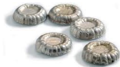
Fig. 3 Electrolytic Ni Rounds

Carbonyl forms such as spherical pellets (0.25" – 0.6" diameter) and flat discs (0.6" - 0.8" diameter) are produced using the Mond Process where nickel carbonyl gas is decomposed in an elaborate device to form solid metal spheres that grow to a predetermined size over time. Carbonyl discs are pellets that have undergone a rolling process to flatten them to simplify handling.