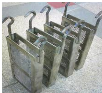
Fig. 8 Nickel Anode Basket

Electrolytic and carbonyl forms (squares, rounds, pellets, discs) found favor among platers because by containing them in an inert (titanium) metal basket it is possible to both maintain consistent anode area and completely consume the anodes resulting in better operational efficiency. Additionally, ease of handling, consistency of size, quality, availability, and operational cost make electrolytic and carbonyl nickel anode the most popular form in use today.