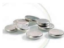
Fig. 5 Carbonyl Ni Disc

Nickel bar anodes are among the oldest forms commercially available but make up a very small percentage of the total nickel anodes used in electroplating. Nickel bar anode have undergone changes in manufacturing technique over the years and are now extruded to form a 3" oval bars in 12-14 feet mill lengths. In practice nickel bar anodes are cut to the end user's specification and are drilled and tapped to accommodate a hook that allows them to hang on the anode bar or rail of the plating tank.