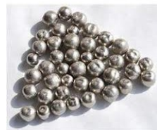
Fig. 4 Carbonyl Ni Pellet

Carbonyl forms such as spherical pellets (0.25" – 0.6" diameter) and flat discs (0.6" - 0.8" diameter) are produced using the Mond Process where nickel carbonyl gas is decomposed in an elaborate device to form solid metal spheres that grow to a predetermined size over time. Carbonyl discs are pellets that have undergone a rolling process to flatten them to simplify handling.