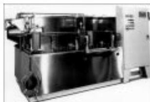
Jensen Fabricating Engineers, Inc.