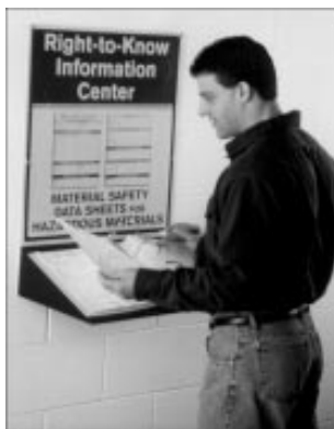
EMED Co., Inc.