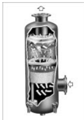
Hayward Industrial Products