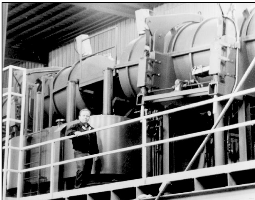
Titanium Hearth Technologies has acquired an electron beam facility in Nevada, which will allow it to increase its titanium recycling and refining capacity to more than 20 million lb/yr.

Funding was also approved for the modernization of the company's Quinacridone (QA) pigment manufacturing facility. QA pigments are red and red shades, and have been made in Newport since the 1950s.