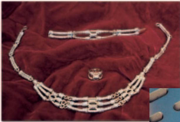
Fig. 5—Electroformed 24K gold jewelry produced on wax mandrels.