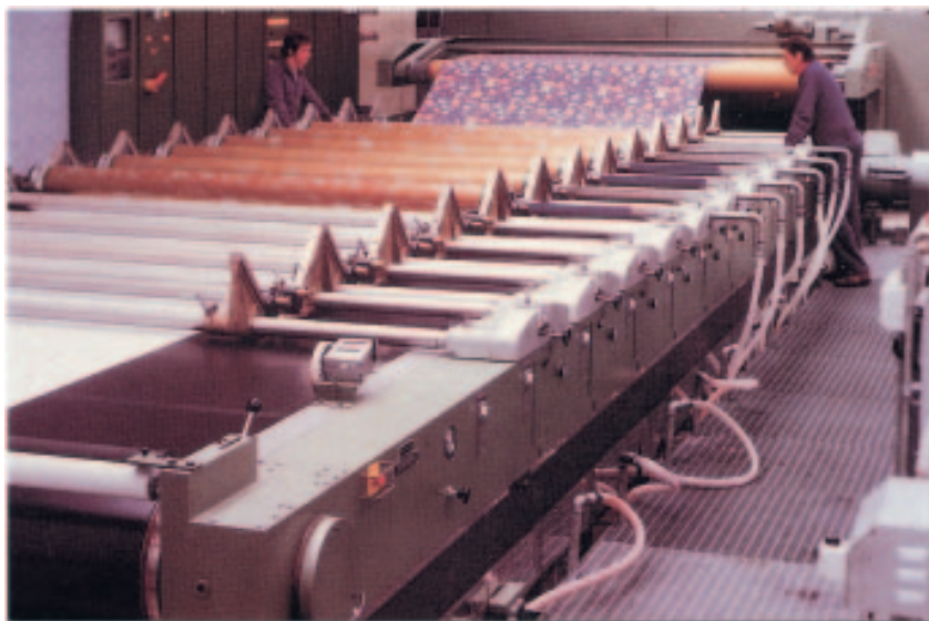
Fig. 2—Textile printing machine. Fabric is passing beneath seven screens to produce the finished pattern.

For the molds, a model of the door panel was probably made in wood, then covered with a piece of high-quality leather. A casting of the part would then be made, probably in reinforced plastic, and then a copy of the original model would be produced in plastic from the casting. This then becomes the mandrel for electroforming. It would be metallized with silver and nickel deposited on the conductive surface to a thickness of 2–3 mm over a period of five or six days. The surface condition of the leather is perfectly reproduced. Such methods