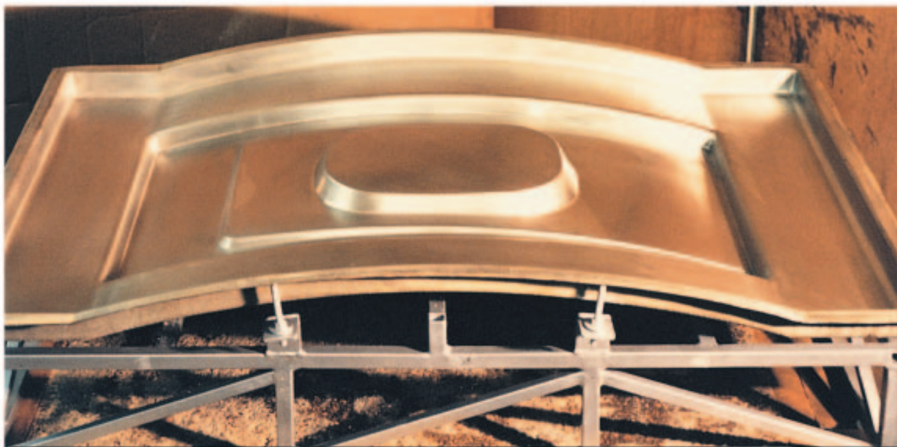
Fig. 3—Nickel mold for producing textured vinyl skin for Airbus window panels.

are used for electroforming molds for other automotive components that have a textured surface, such as vinyl skins for dashboards.