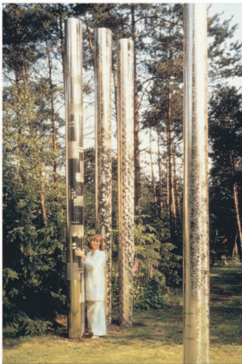
Fig. 1—A selection of very long rotary printing screens.

those closely associated with electroforming. In fact, we are familiar with some very specialized applications that are exceptional in scale, technology and expertise. These would include the use of electroforms in the aerospace, aircraft and electronic industries, for instance, where mechanical and physical properties are usually critical. There are many other applications, however, to which we can more easily relate, because we have experience with them every day. Is the public aware of its dependence