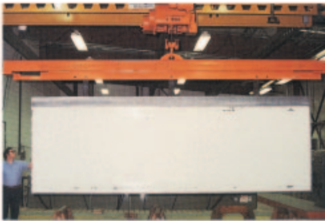
Fig. 4—Huge nickel mold for producing hardboard with simulated wood grain.

The dollar bill exchanged for the popsicle seems well spent on such a warm day, but is Pat thinking yet of electroforming? Not at all. In fact, like most people, she is unaware of the intricate design and detail on all the paper currency handled in such enormous quantities each day. In most countries, the original designs are usually produced on steel plates by master engravers and then, following a series of hardening and reproduction stages, the final plates or rolls for use on the presses are electroformed in nickel sulphamate solutions. Every detail in the original