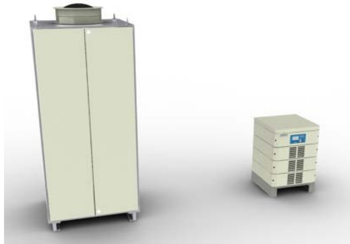
SCR & modular switch mode rectifier